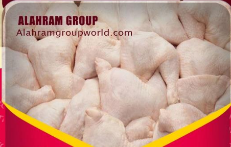
ALAHRAM GROUP Alahramgroupworld.com