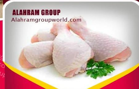
ALAHRAM GROUP Alahramgroupworld.com