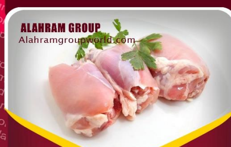
ALAHRAM GROUP Alahramgroupworld.com