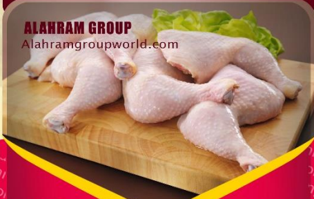
ALAHRAM GROUP Alahramgroupworld.com