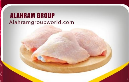
ALAHRAM GROUP Alahramgroupworld.com