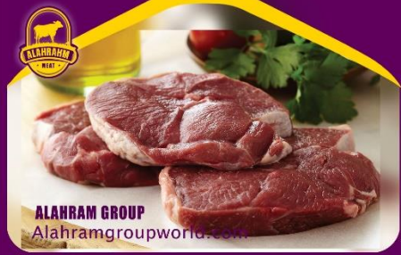
ALAHRAHM GROUP Alahramgroupworld.com