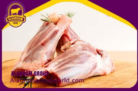
ALAHRAHM GROUP Alahramgroupworld.com