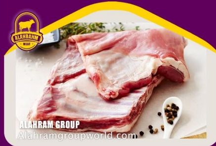
ALAHRAM GROUP Alahramgroupworld.com