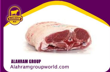
ALAHRAM GROUP Alahramgroupworld.com