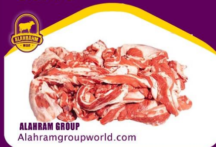
ALAHRAM GROUP Alahramgroupworld.com