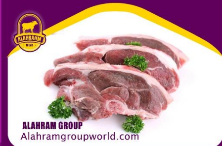
ALAHRAM GROUP Alahramgroupworld.com