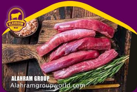
ALAHRAM GROUP Alahramgroupworld.com