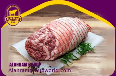
ALAHRAHM GROUP Alahramgroupworld.com