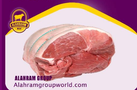
ALAHRAM GROUP Alahramgroupworld.com