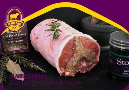
ALAHRAHM GROUP Alahramgroupworld.com