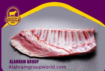
ALAHRAM GROUP Alahramgroupworld.com