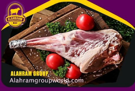
ALAHRAHM GROUP Alahramgroupworld.com