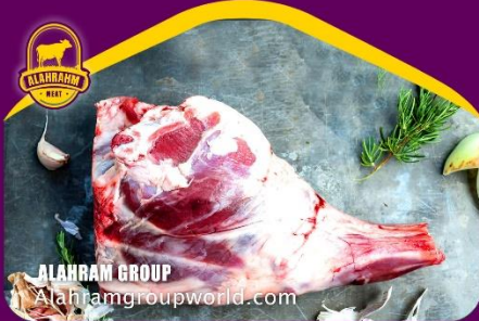
ALAHRAHM GROUP Alahramgroupworld.com