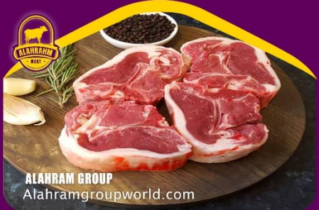
ALAHRAHM GROUP Alahramgroupworld.com