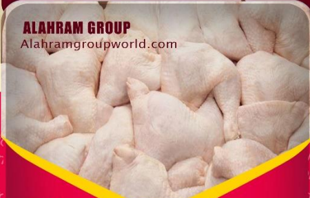
ALAHRAM GROUP Alahramgroupworld.com