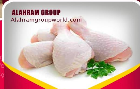
ALAHRAM GROUP Alahramgroupworld.com