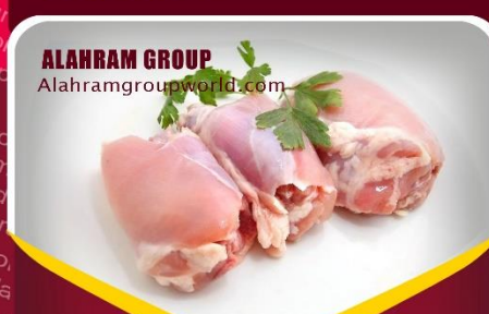
ALAHRAM GROUP Alahramgroupworld.com