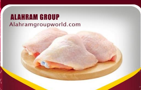
ALAHRAM GROUP Alahramgroupworld.com