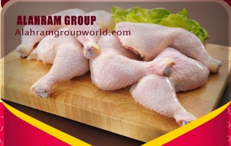
ALAHRAM GROUP Alahramgroupworld.com